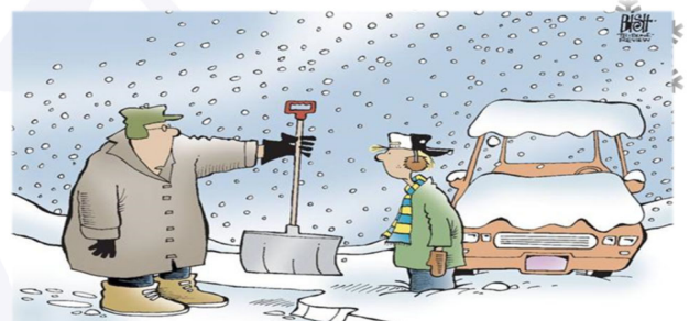
SORRY, SON... THERE'S NO APP FOR THAT